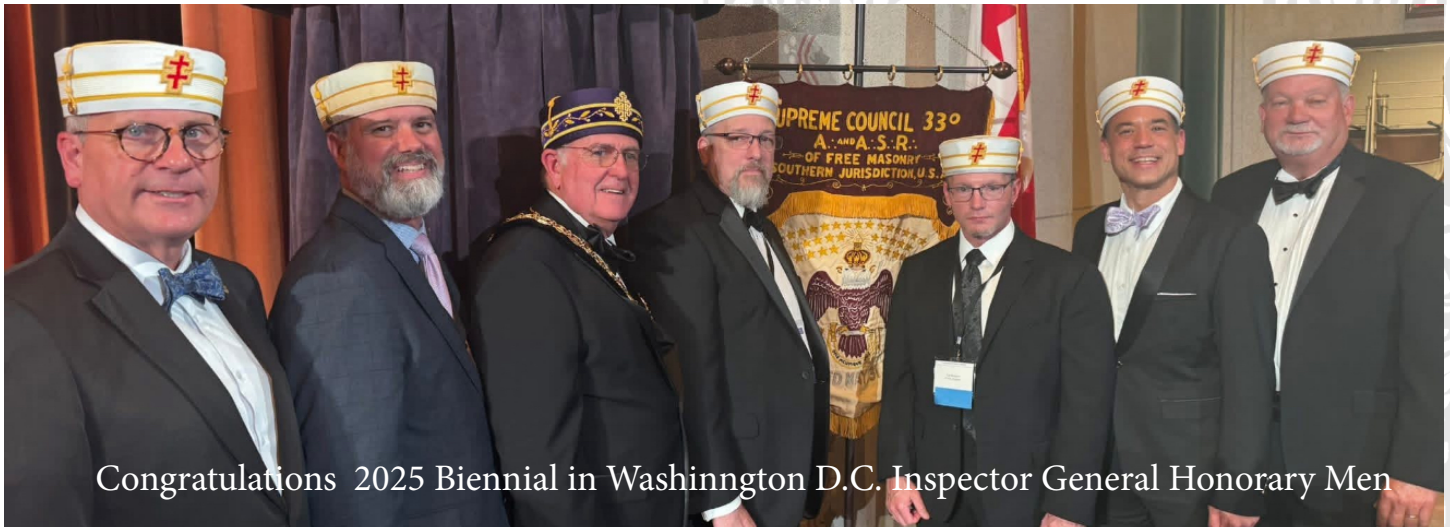
Congratulations 2025 Biennial in Washinngton D.C. Inspector General Honorary Men