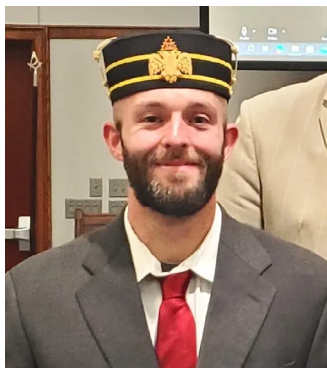
High Country Scottish Rite Club