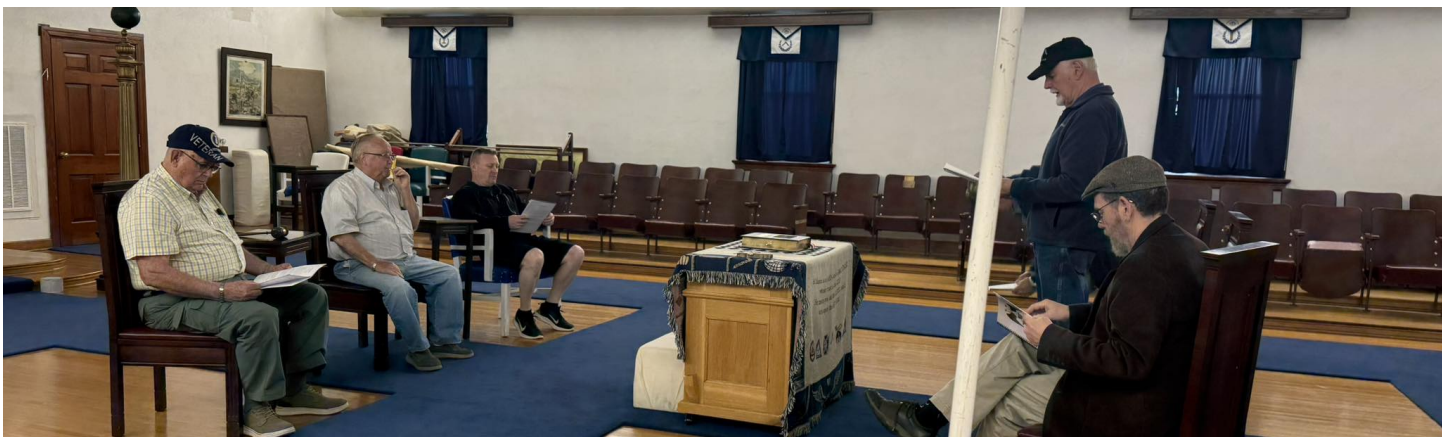
Practice night for the 2026 Spring Reunion!

The Orient of North Carolina is evolving, and your passion is the spark we need to build an even brighter tomorrow. By joining now, you step into a dynamic future of innovative programming, statewide collaborations, and leadership opportunities that will define Scottish Rite Masonry for generations. Don't just witness the evolution—be the architect. Petition today and join the future of fellowship, enlightenment, and impact!